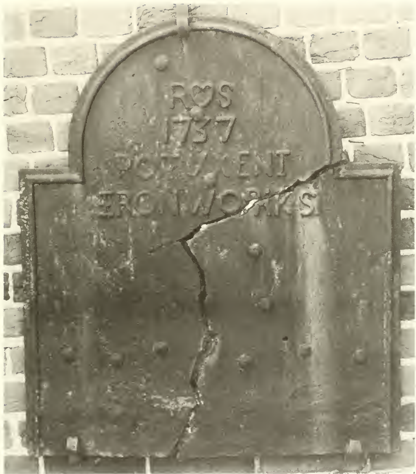
Fireback by the Patuxent Furnace; cast iron; Anne Arundel Co., Md.; 1737. HOA 36"; WOA 30 3 / 8 ". Courtesy of the Historic Annapolis Foundation, Annapolis, Md.